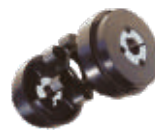
HRC Jaw Coupling