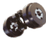
HRC Jaw Coupling