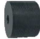
Poly V Pulley